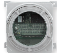
DCT in optional Explosion-proof enclosure