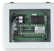
DCT in optional NEMA 4/4X weatherproof enclosure